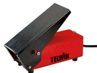
FOOT REMOTE CONTROL 14 POLES 802017